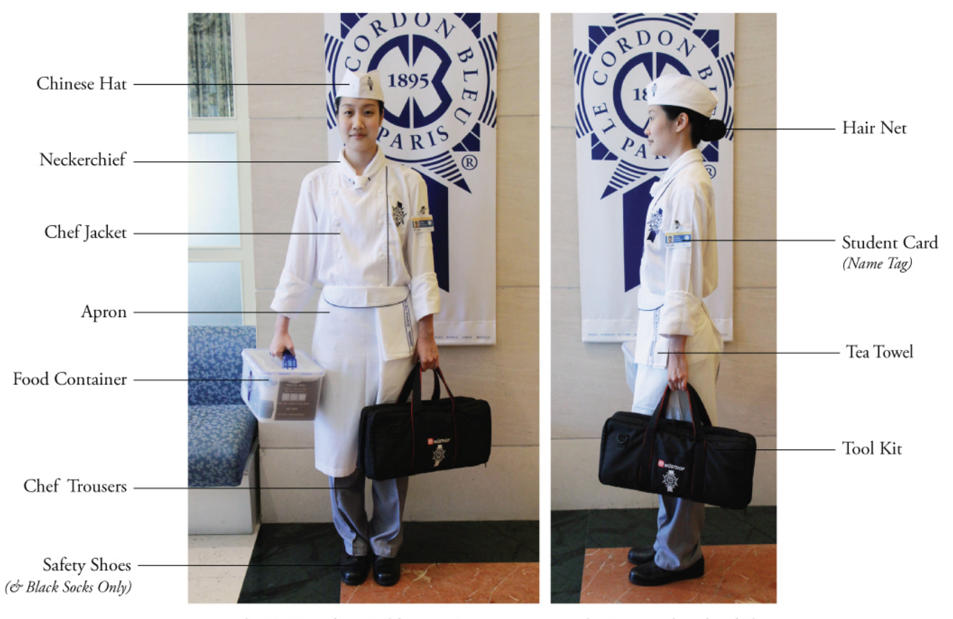
Remark: NO jewelry, visible piercing, earings, watch, rings and nail polish.