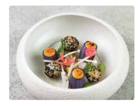
SUPERIOR CUISINE "THE PLATE AS YOUR CANVAS"

Through practice and repetition, you will begin to perform tasks with more ease and instinct, and demonstrations highlight various presentations from platter to plate. Intermediate Cuisine emphasizes the importance of "mise en place," understanding organization, production, and presentation.