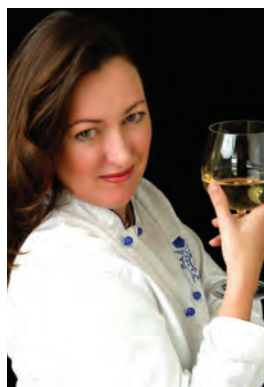
Kathleen Flinn Diplôme de Cuisine Author: "The Sharper Your Knife, the Less You Cry"

For our renowned hands-on practical classes, you will have your own workstation in our teaching kitchens to prepare the dish you observed in your demonstration class. We provide the ingredients, and students are able to take home their creations at the end of the day. With a student-to-master chef ratio of no more than sixteen-to-one, practical classes maximize the one-on-one learning experience.